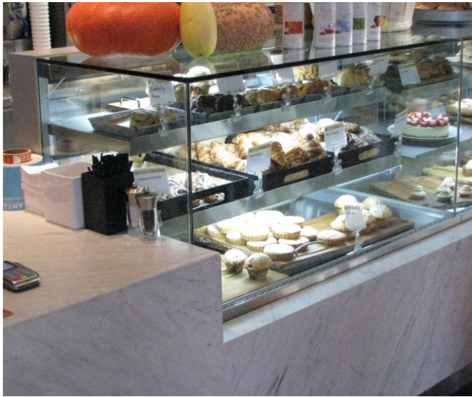
SQD 4848 W/STAINLESS STEEL SHELVES